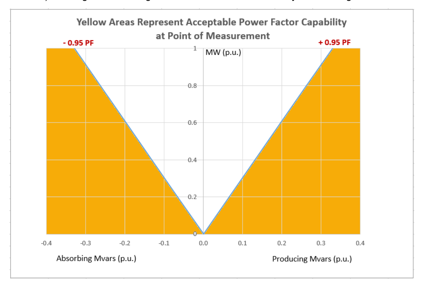
Figure 2 - A Generic Example Graph of Acceptable Power Factor Capability

This power factor requirement applies at all power output levels unless the Generating Facility is physically disconnected from the ATC transmission system. Physically disconnected means an open